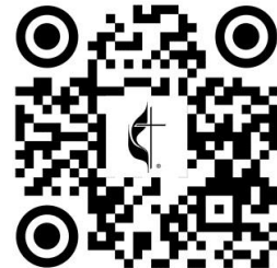
UMCOR US Disaster 2017

Or you may follow this QR code to donate directly.